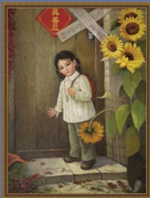
Homeless ( Oil on canvas ) A little girl comes home from school only to find her parents gone. The two pieces of white paper on the door are official notices stating that the house has been sealed off by the "6-10 Office," a Gestapo-like agency in the Chinese government setup specifically to "eradicate" Falun Gong.