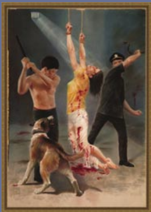
Relentless ( Oil on canvas ) This is a scene from a Chinese detention center, where prison guards receive orders to "reform" people who practice Falun Gong, that is, force them to renounce their beliefs. When brainwashing sessions do not work, practitioners are subjected to relentless beatings and torture, sometimes resulting in death.