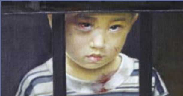
Why? ( Oil on canvas ) This painting is based on a true story. The mother and son were arrested in China simply because they practice Falun Gong. After being beaten, the boy is filled with only a question: "Why?" Why were they being detained and treated this way?