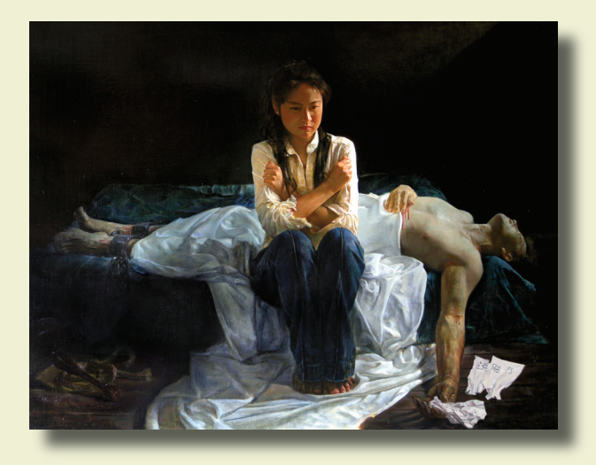
A Tragedy in China ( Oil on canvas ) A wife weeps beside her husband, who has been tortured to death at a brainwashing center. He holds in his hand a document that he was ordered to sign, a pledge to give up his belief in Falun Dafa.

In Harmony ( Oil on canvas ) A young woman is doing the fifth exercise of Falun Gong. The clear water and blue sky reflect her tranquility and give a feeling of her union with heaven while she meditates.