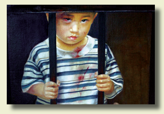
Why? ( Oil on canvas ) This painting is based on a true story. A mother and son were arrested in China because they practice Falun Gong. Being beaten, the boy held back his tears asking: Why did the policemen beat my mom and me?