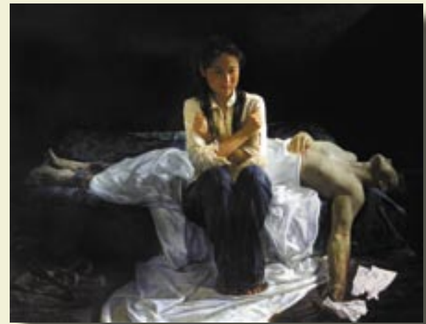
A Tragedy in China (Oil on canvas) A wife weeps beside her husband, who has been tortured to death at a brainwashing center. He holds in his hand a document that he was ordered to sign, a pledge to give up his belief in Falun Dafa.