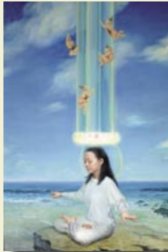
In Harmony (Oil on canvas) A young woman is doing the fifth exercise of Falun Gong. The clear water and blue sky reflect her tranquility and give a feeling of her union with heaven while she meditates.

These paintings remind the world that when persecution meets the principles of Truthfulness, Compassion and Tolerance, ordinary people become extraordinary. Falun Gong practitioners have met the persecution with an uncompromising courage, responding to hatred and brutality with grand compassion, endurance and an unwavering commitment to justice.