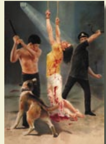
Relentless (Pastel on paper) This is a scene from a Chinese detention center, where prison guards are given directives to "transform" people who practice Falun Gong; that is, force them to renounce their beliefs. When brainwashing classes do not work, practitioners are subjected to relentless beating and torture, sometimes unto death.