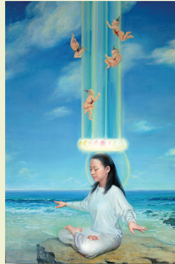
In Harmony (Oil on canvas) A young woman is doing the fifth exercise of Falun Gong. The clear water and blue sky reflect her tranquility and give a feeling of her union with heaven while she meditates.

These paintings remind the world that when persecution meets the principles of Truthfulness, Compassion and Tolerance, ordinary people become extraordinary. Falun Gong practitioners have met the persecution with an uncompromising courage, responding to hatred and brutality with grand compassion, endurance and an unwavering commitment to justice.