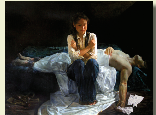
A Tragedy in China (Oil on canvas) A wife weeps beside her husband, who has been tortured to death at a brainwashing center. He holds in his hand a document that he was ordered to sign, a pledge to give up his belief in Falun Dafa.