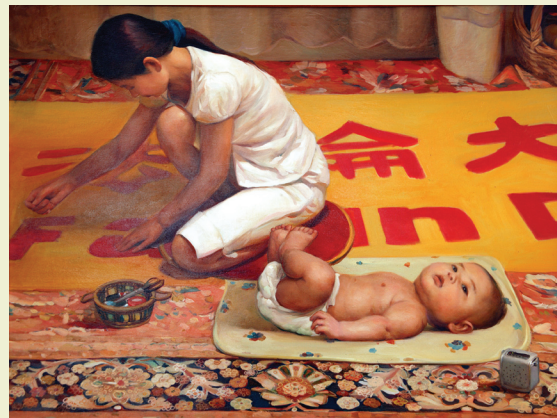
Banner (Oil on canvas) The young mother is sewing a banner with the words "Falun Dafa is Good" in both Chinese and English. Countless Falun Gong practitioners have used these words to make public appeals to end the systematic persecution in China. The healthy baby in the foreground suggests that life and faith continue, despite efforts to eradicate them.