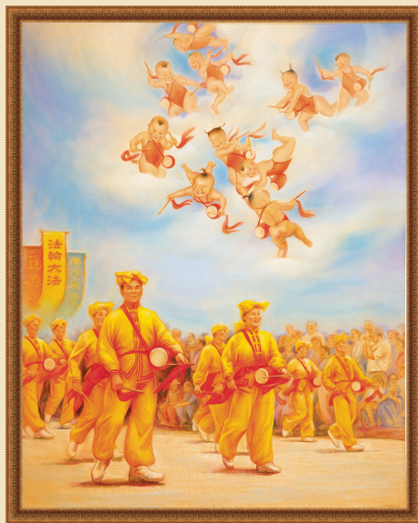
Waist Drum ( Oil on canvas ) In many major cities around the world, people who practice Falun Gong participate in parades to celebrate traditional Chinese culture. The artist has drawn celestial beings playing amidst the clouds, echoing the unified beat from below.