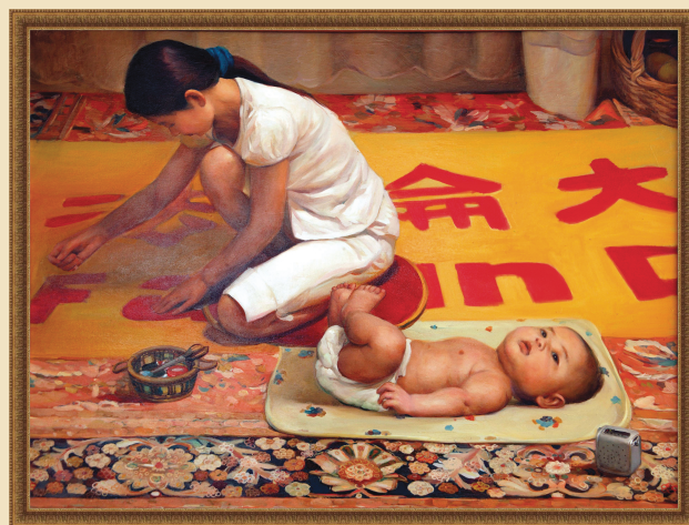
Banner ( Oil on canvas ) The young mother is sewing a banner with the words "Falun Dafa is Good" in both Chinese and English. They are positive words, but also words that Chinese Communist Party officials fear: countless practitioners of Falun Gong have used them to make public appeals to end the systematic persecution in China. The healthy baby in the foreground suggests that life and faith continue, despite efforts to eradicate them.