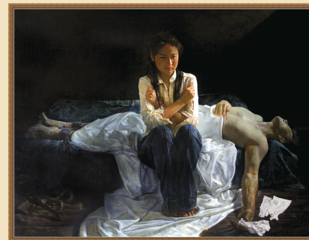
A Tragedy in China ( Oil on canvas ) A young woman is stricken with grief as her husband lies dead by her side, slain by torture in a brainwashing center. In his hands are documents authorities demanded he sign, disavowing Falun Gong; they are torn in half. For many, refusal to sign leads to torture and even death.