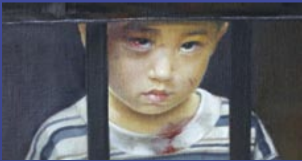
Why? ( Oil on canvas ) This painting is based on a true story. The mother and son were arrested in China simply because they practice Falun Gong. After being beaten, the boy is filled with only a question: "Why?" Why were they being detained and treated this way?