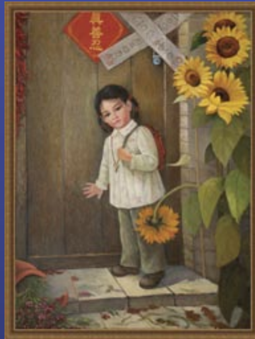
Homeless ( Oil on canvas ) A little girl comes home from school only to find her parents gone. The two pieces of white paper on the door are official notices stating that the house has been sealed off by the "6-10 Office," a Gestapo-like agency in the Chinese government setup specifically to "eradicate" Falun Gong.