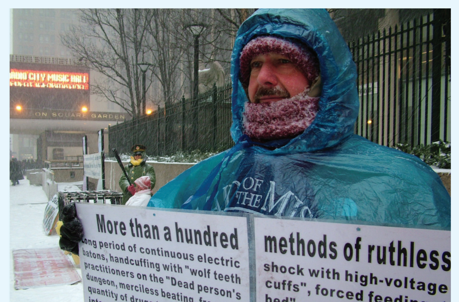
Braving the snow while holding a poster of CCP's torture methods in Manhattan, NY.