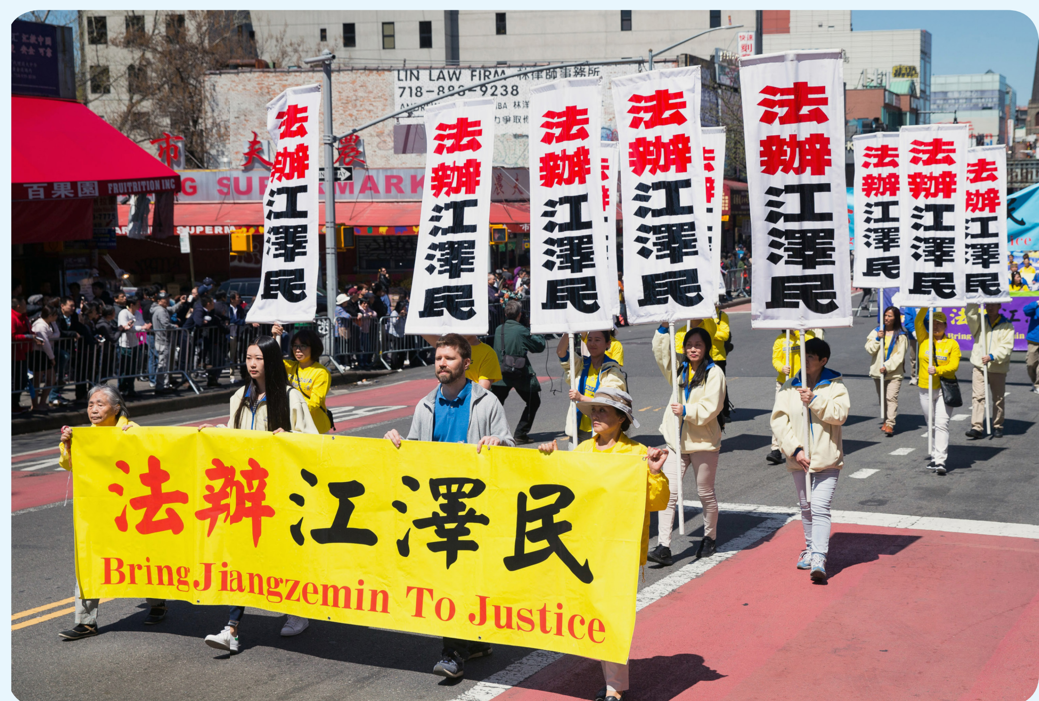
"Bring Jiang Zemin To Justice", 04/23/2017, parade in Flushing, New York