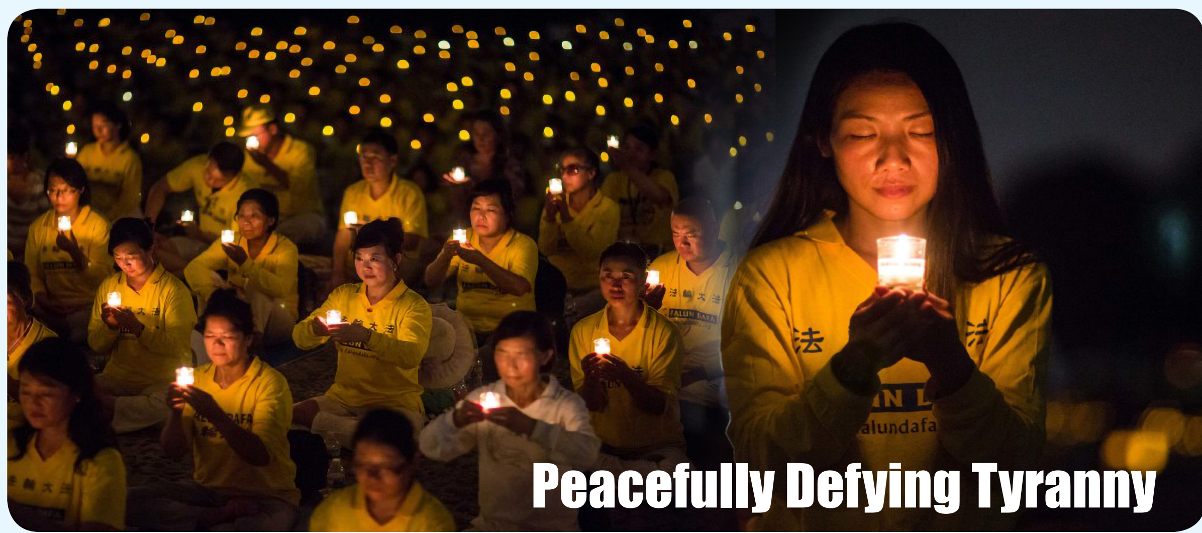
Peacefully Defying Tyranny

Exposure of the crimes against Falun Gong in China has been paramount to the peaceful resistance of practitioners overseas.