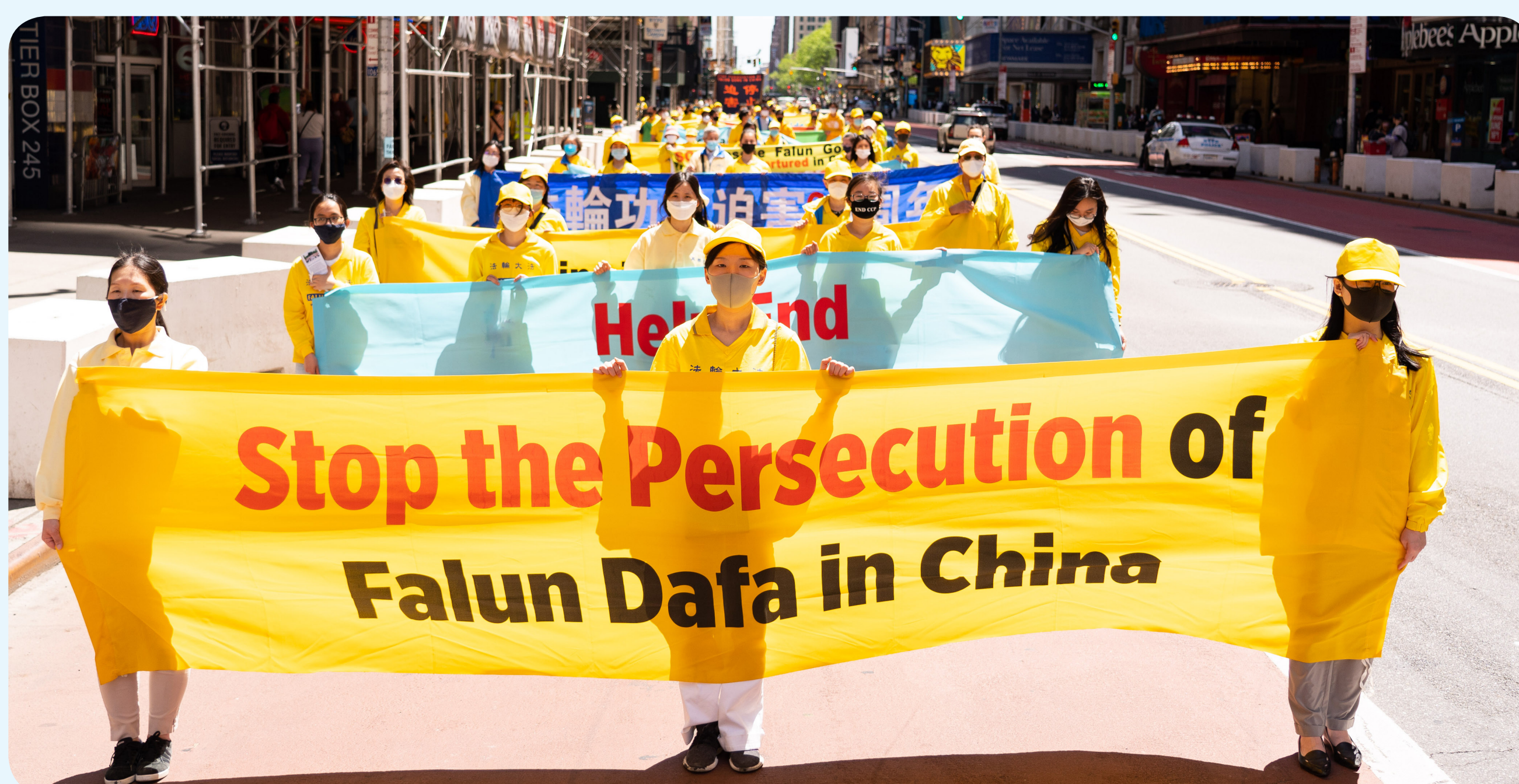
05/13/2021, the 22nd anniversary of World Falun Dafa Day, parade in NK