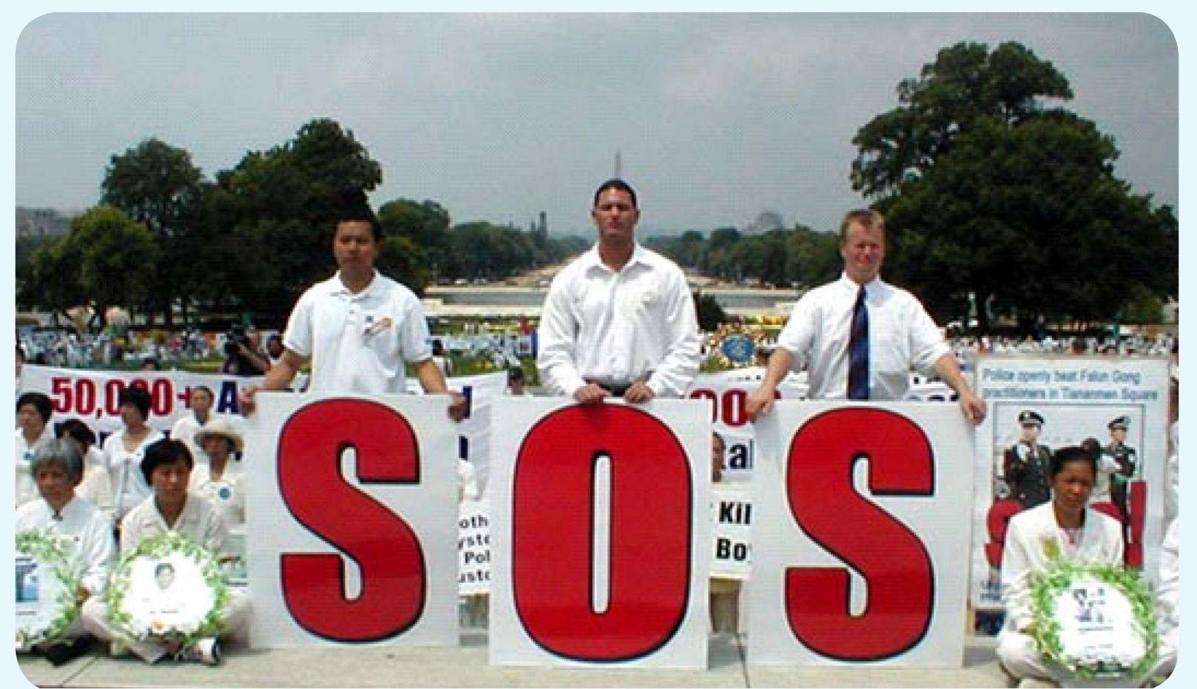
Capitol Hill, Washington D.C. Calling kind people around the world to help stop the killing and Torture of Falun Gong practitioners in China.

Exposure of the crimes against Falun Gong in China has been paramount to the peaceful resistance of practitioners overseas.