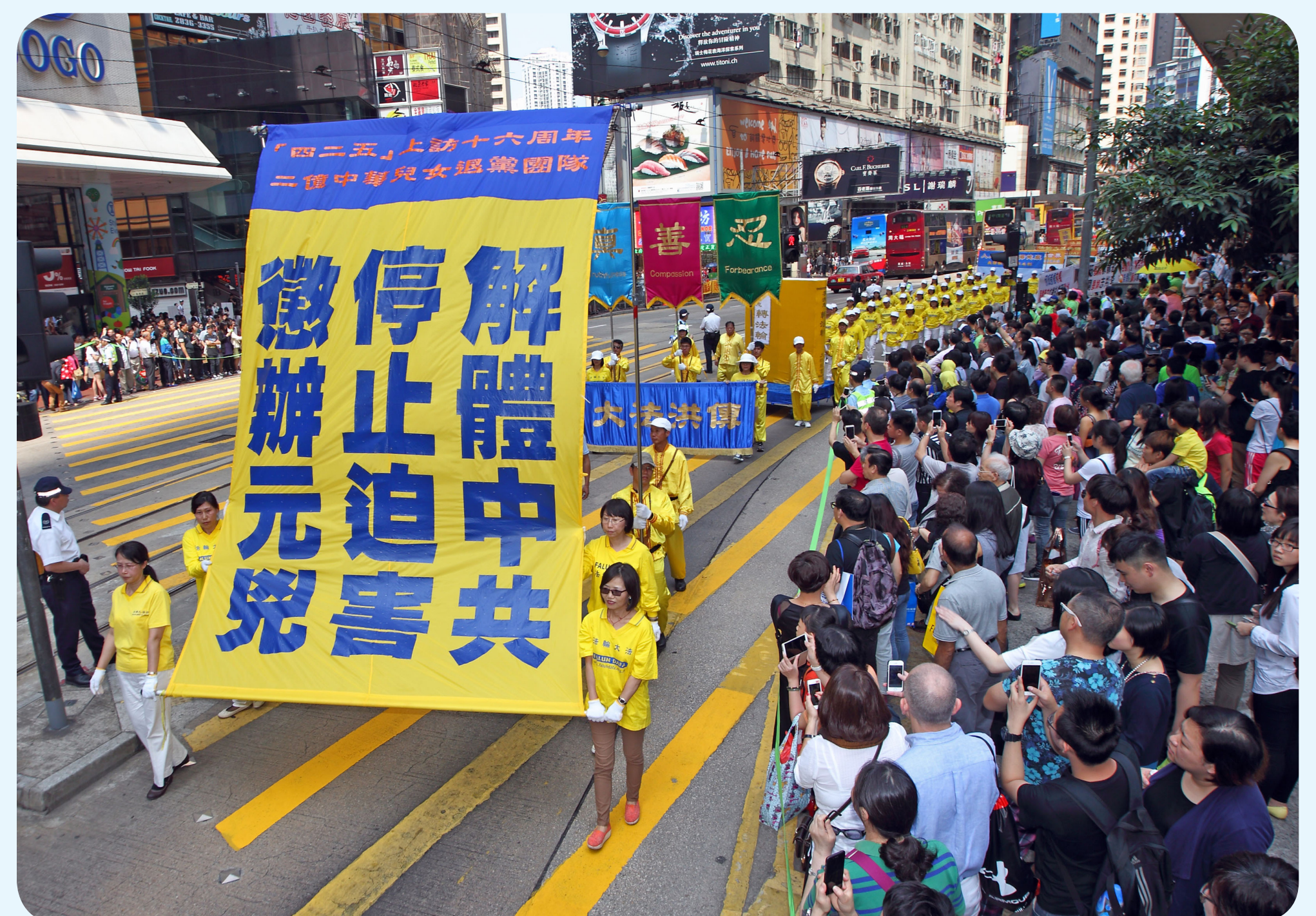
Disintegrate the CCP, stop the persecution, and punish the culprit. parade in Hong Kong, April 28, 2015.