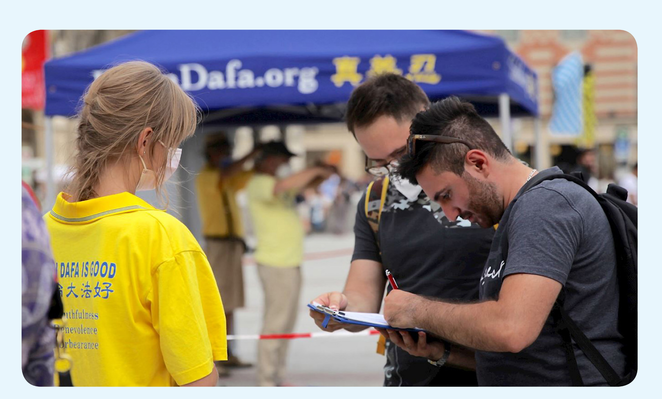
Passersby sign a petition to condemn the CCP's persecution of Falun Dafa.

United States to reject applications for residency or citizenship from members of all communist parties.—October 05 2020.