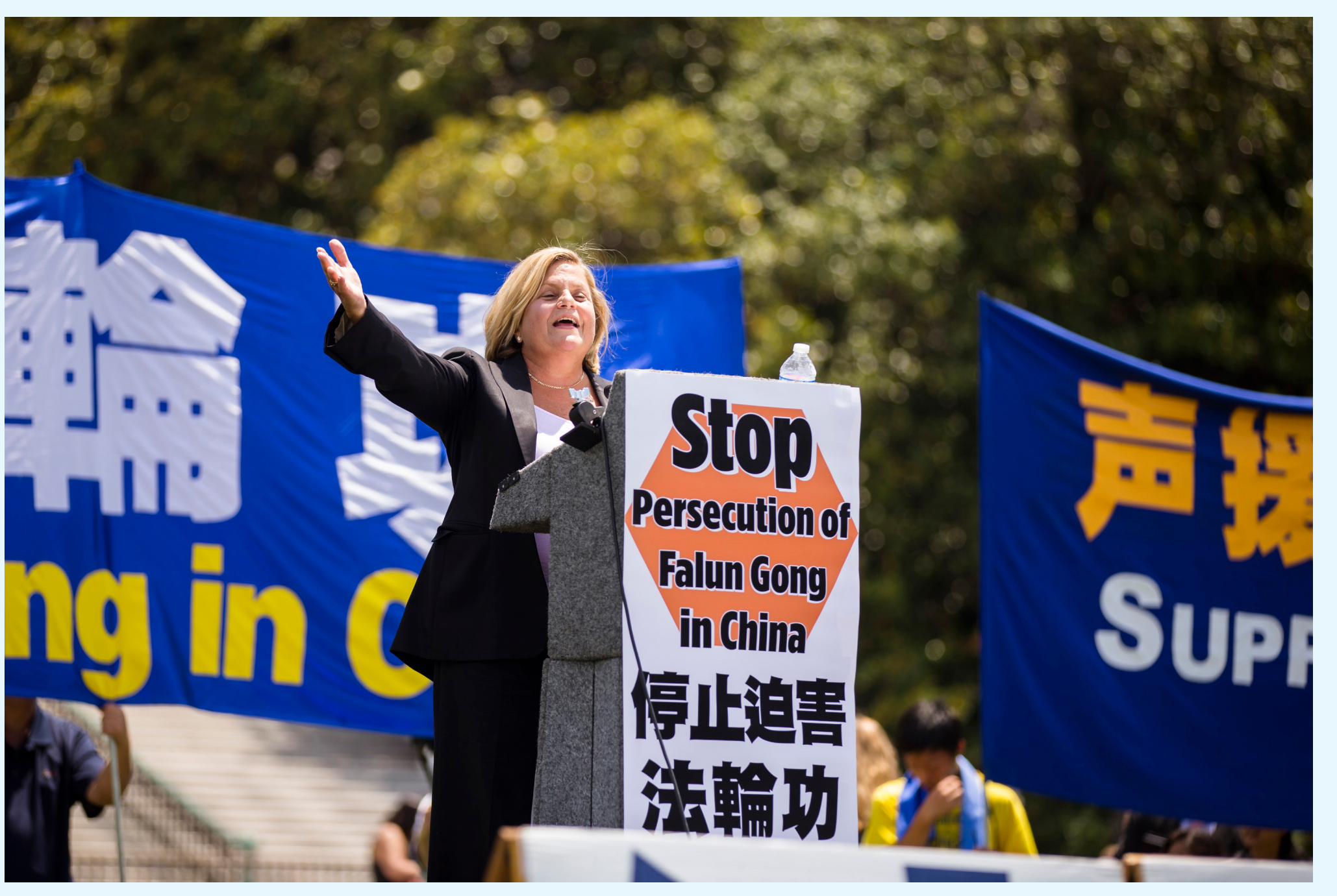
Congresswoman Ileana Ros-Lehtinen (R-FL) speaks at a Falun Gong rally on Capitol Hill in Washington 07/16/2015.

In 2008, the Israeli parliament enacted the organ transplant law. Israel became the first country to ban its citizens from travelling to China, where no ethical rules apply concerning organ transplantation.