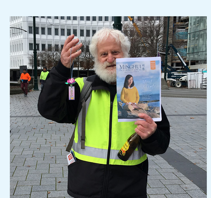
Spreading the word: Grassroots efforts to raise awareness have brought together young and old, relaying an urgent message.